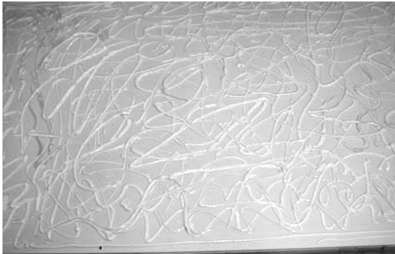
Figure 1: Typical Green Glue Random Application Pattern

The gypsum board panels were laminated together with green glue. The client reported that the green glue was applied from adhesive cartridges in 3/16" beads in a random pattern over the whole panel. The aging period was over 40 days, greater than the 14 days period stated in ASTM Standard E90 for water-base adhesives. The assemblies were dried on 4' x 8' wood-stud frames, spaced out and with forced air ventilation according to the client.