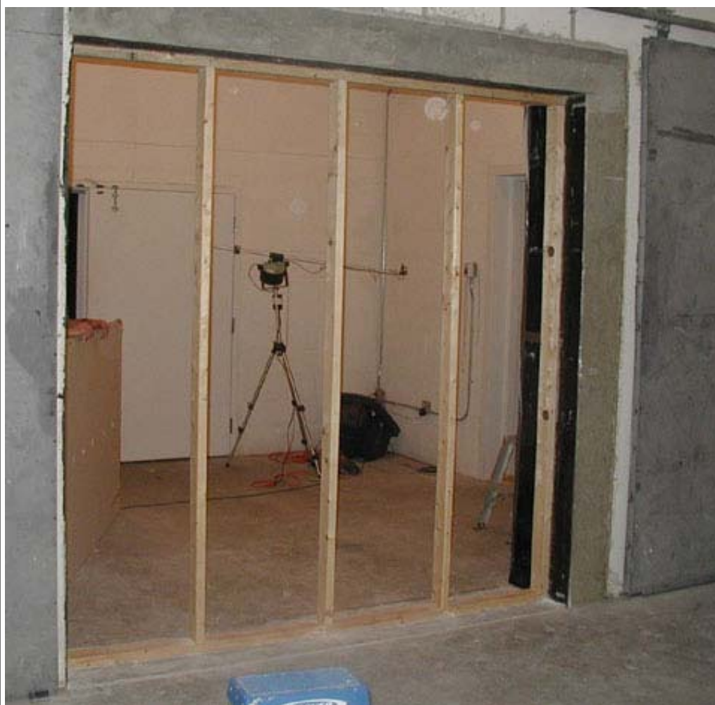
Figure 2: Wood-stud Specimen Frame in Opening

The specimen arrived at the laboratory still mounted on the wood stud frames. Fastener heads on the base layer panel were accessible via pre-drilled holes through the face layer, approximately 1/2" in diameter. A new wood-stud frame was erected in the specimen opening. The glued wall panels were demounted from the drying frames, and then remounted on the frame in the opening.